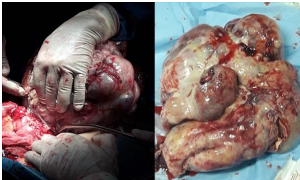
Figure 2: Image showing a left ovarian mass adherent to the sigmoid colon.